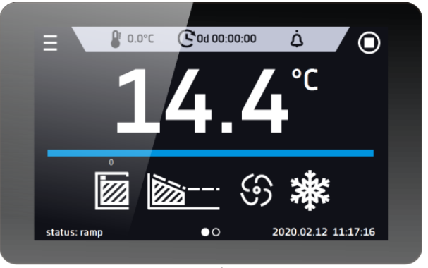
Smart - preview screen